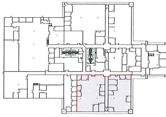
KEY PLAN Not to Scale